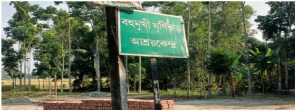
Plate 5: Primary School in Kuemuri Village