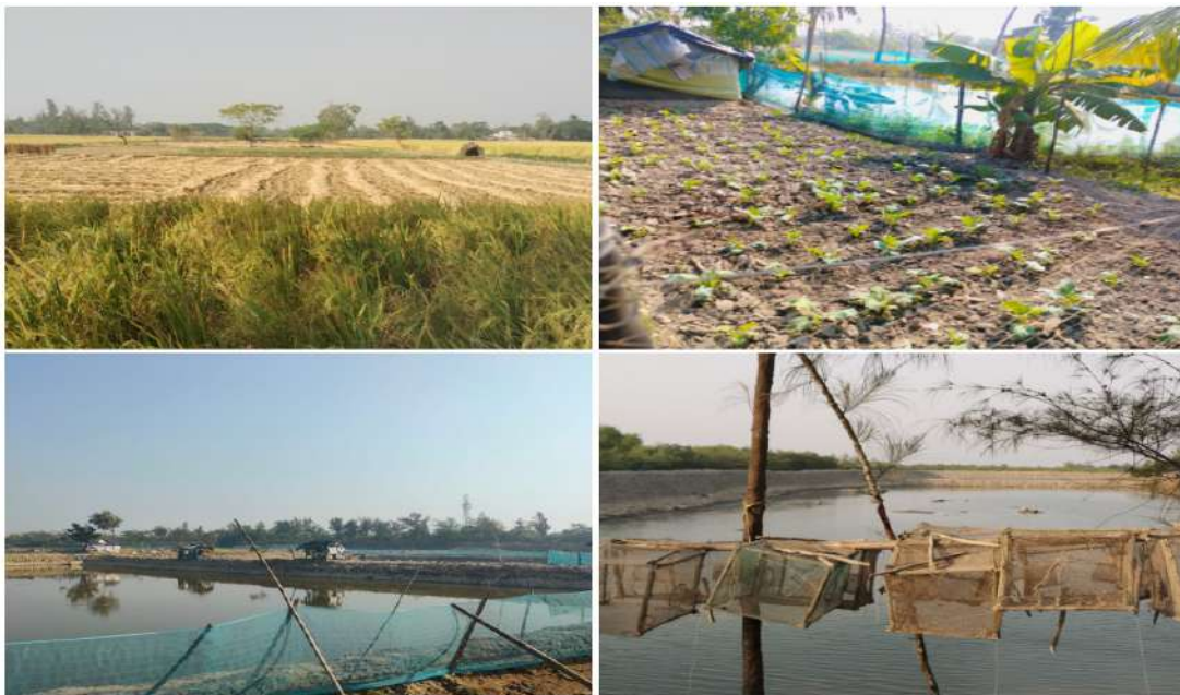
Plate 2: Crop Cultivation in Kuemuri

(Top left: Dudheswar Paddy, Top right: Vegetable, Bottom right: Crab Collection & Bottom left: Pisciculture)