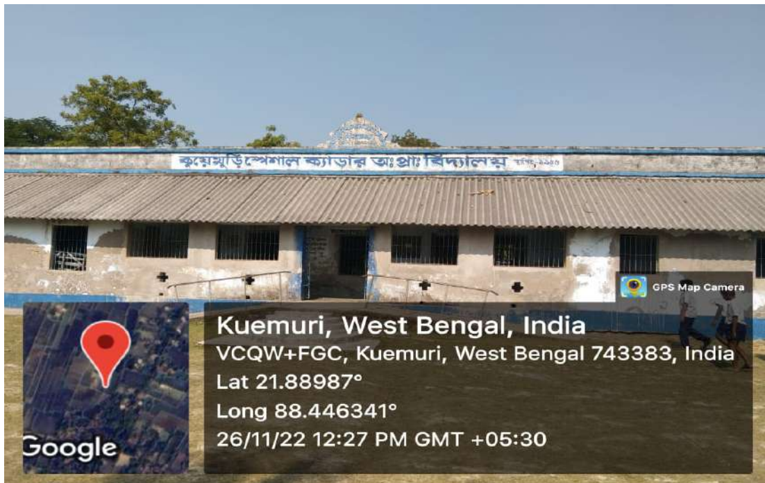
Plate 4: Amphan Relief Centre at Kuemuri Village