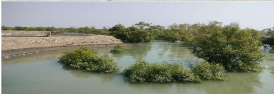
Plate 6: Low and High Tide