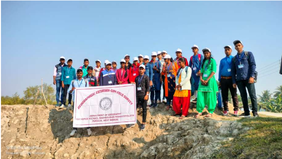
Plate 1: The Survey Team at Kuemuri Village, 2022