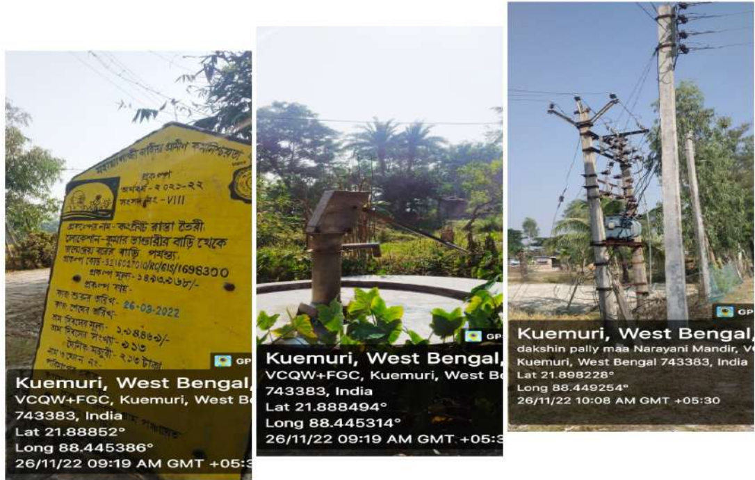
Plate 3: Condition of Road, Water & Electricity at Kuemuri Village